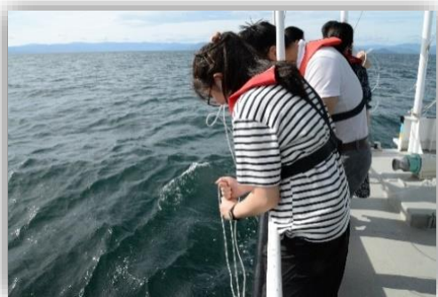
(Kyoto Summer Program 2019)

Off-campus activities designed to deepen understanding of Japanese and Kyoto culture, industry, and ecology. These will be provided online this year.