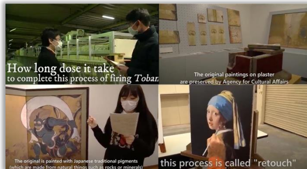
(Kyoto Spring Program 2021 (Online))